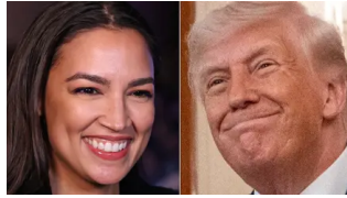
'Wah, Wah, Wah': Alexandria Ocasio-Cortez Taunts Trump & GOP's Newest Gripe