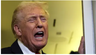
Trump Drops Stunning New 2-Word Description Of Himself, And Critics Can't Believe It