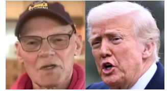
James Carville Issues Direct Challenge To Trump After 'Wacko' Attack