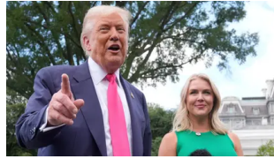
'Wasn't My Decision': Republicans Starting To Regret Trump's Redistricting War