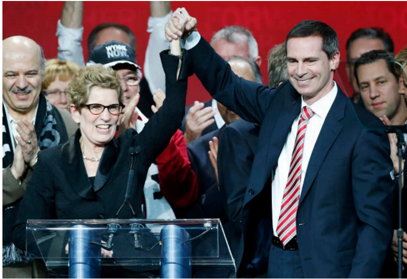
Kathleen Wynne is congratulated by outgoing Dalton McGuinty after winning the leadership bid to become the new premier of Ontario at the Ontario Liberal leadership convention in Toronto Jan. 26, 2013.

In 2013, amid a barrage of scandals , both Premier McGuinty and Finance Minister Dwight Duncan stepped down in what was portrayed as a period of renewal. Kathleen Wynne emerged as new party leader and Premier of Ontario, positioning herself as the "social justice" and "activist" premier against the old guard. In practice, however, much of the Harris-McGuinty legacy continued.