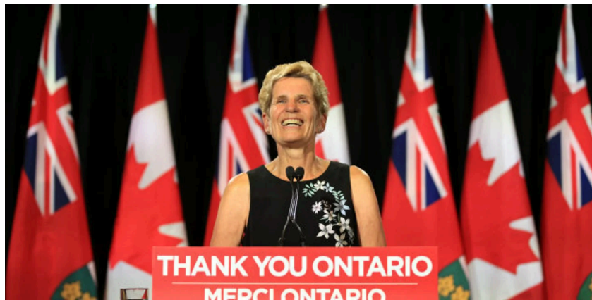
Former Ontario premier Kathleen Wynne addresses the election loss that left the Liberals with only 7 seats on June 8, 2018.

This post was published on the now-closed HuffPost Contributor platform. Contributors control their own work and posted freely to our site. If you need to flag this entry as abusive, send us an email.